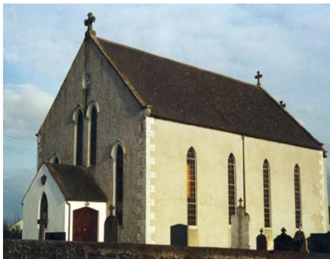
St. Peter's Church, Collegeland