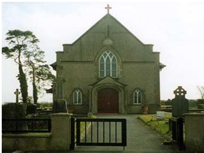
St. John's Church, Tartaraghan