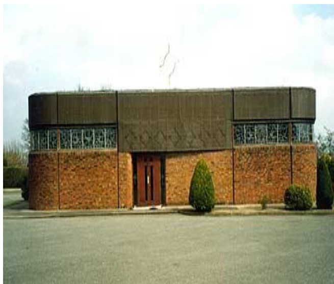
Our Lady Queen of Peace Church, Maghery