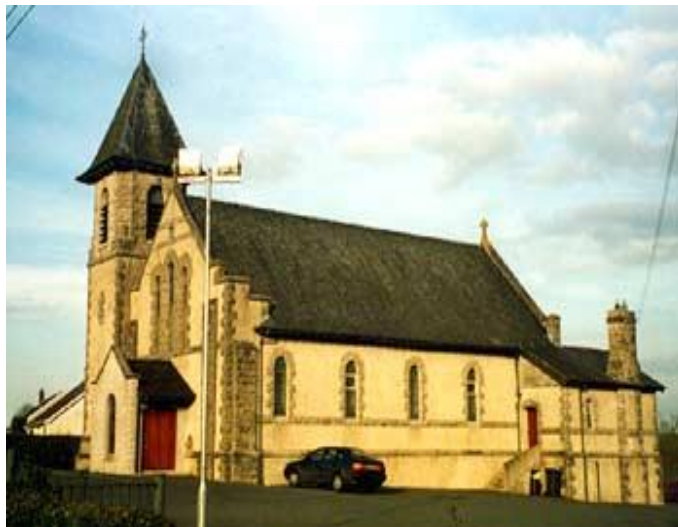
St. Patrick's Church, Loughgall