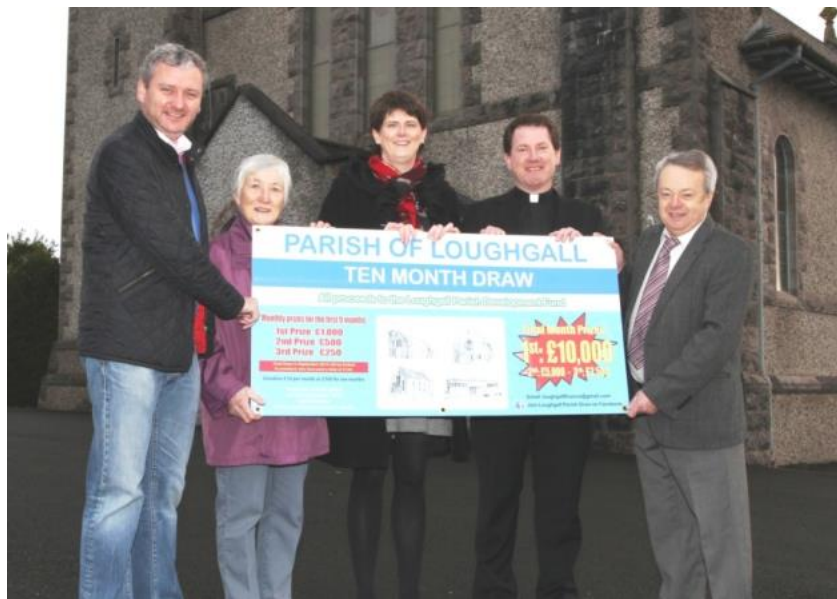
The Official launch of the Loughgall Parish Development Draw

Here's hoping we win a prize- and that our Parish makes a lot of money in the process.