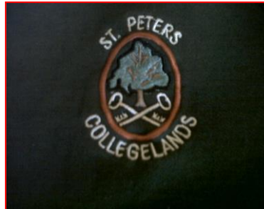
My old School Crest